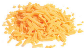
½ cup of shredded cheddar cheese