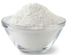
3 teaspoons of all-purpose flour