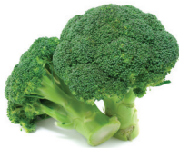
8 ounces of fresh broccoli florets, blanched