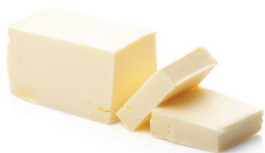
2 tablespoons of butter or margarine