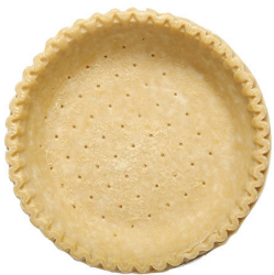
1 10" frozen pie shell